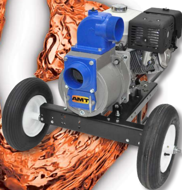
4" Engine Driven Trash Pump

AMT Engine Driven Trash pumps are designed for applications which require high flow and solid handling capability. These pumps are constructed of heavy duty sand cast aluminum components featuring removeable/replaceable cast iron volutes, impellers and wearplates. Simple cleanout design permits easy removal of trash and debris without disconnecting hoses. Pumps are designed to handle liquids with solids content or dissolved solids and debris. Cast iron discharge port rotates in 90° increments. An electric start option is available on many models.