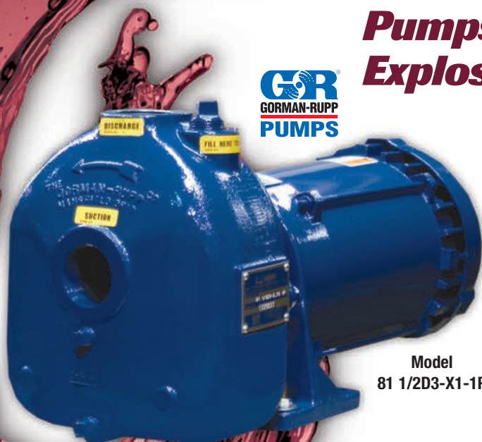
Model 81 1/2D3-X1-1P